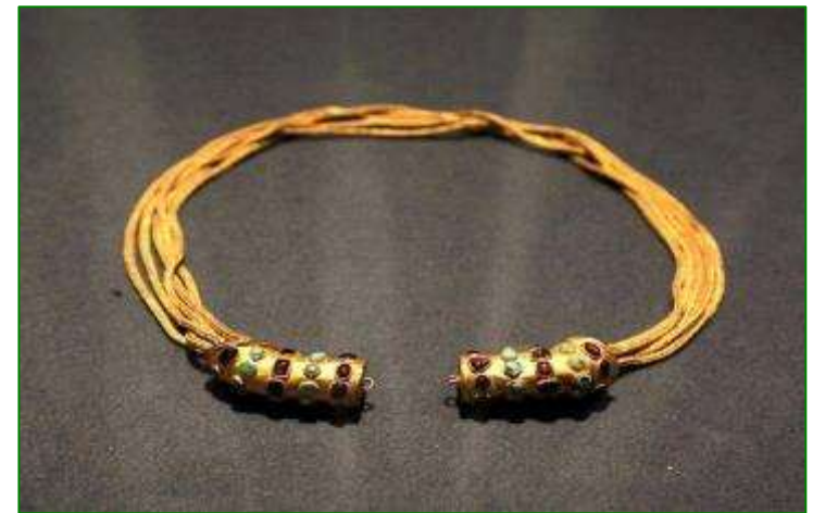
VARAKSHA FRESCO AND DALVERZIN TEPE JEWELLERY